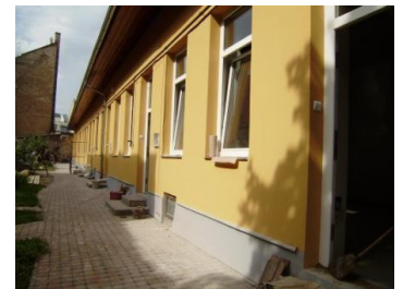
After the renovation

Beside painting, creating bathrooms, and other internal renovations new rooms have been built in the attics. This way many of the children in the participating families will have a room of their own for the first time.