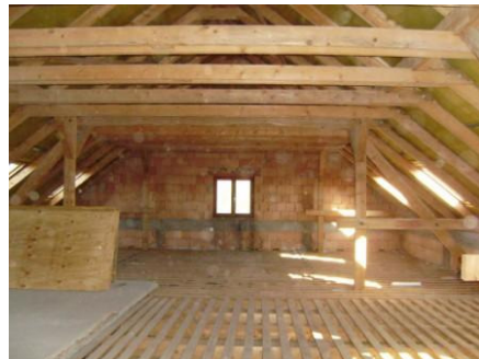
The attic before the renovation

Volunteers from the last team working at the shelter