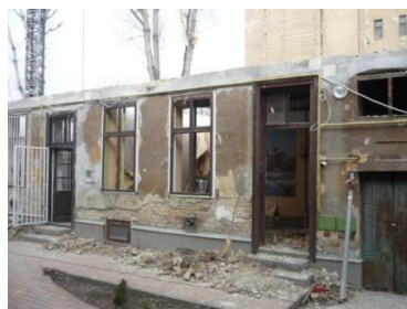
The units before the renovation

We were very happy to start a project in Budapest, the capital of Hungary this Summer. In a cooperation with Rév8, a local urban rehabilitation organization, 7 social rental units have been renovated with the help of volunteer teams.